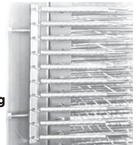
The exclusive Floating Bar spring tensioning